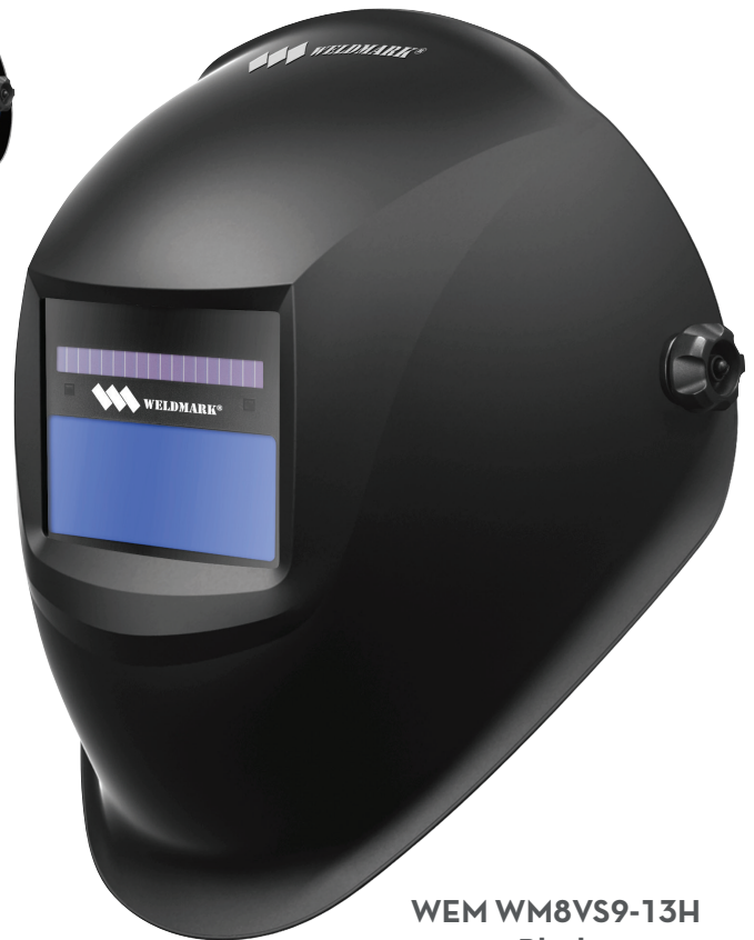
WEM WM8VS9-13H Black