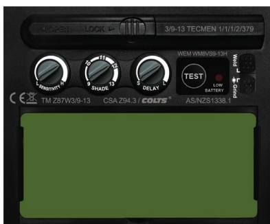
High Performance Lens (DIN 1/1/1/2)