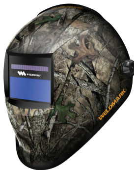
WEM C8VS9-13H Camo