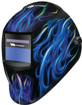
WEM BF8VS9-13H Blue Flame