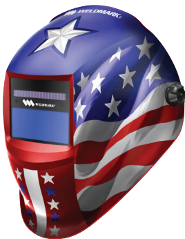
WEM SS8VS9-13H Stars & Stripes