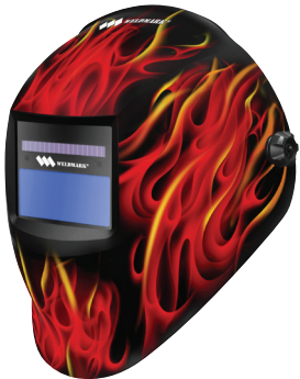
WEM RF8VS9-13H Red Flame