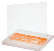
WEM SV45 Inside Cover Lens