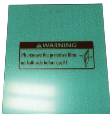
WEM WMFC45 Front Cover Lens