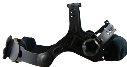
WEM AHG-15 Articulating Headgear