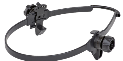
WEM HH-ADPTR-RV Hard Hat Adaptor