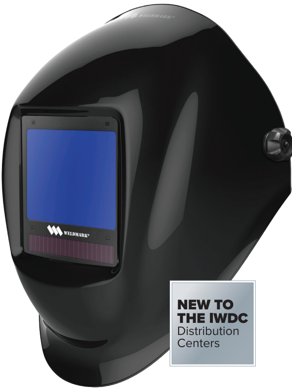
WEM BGSV Glossy Black Super View ADF Welding Helmet