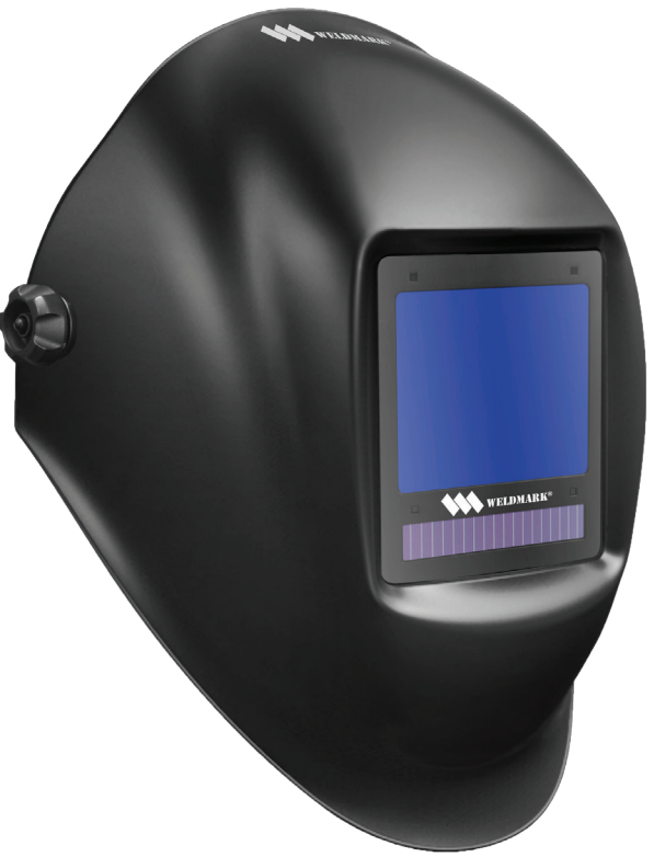
WEM BSV Matte Black Super View ADF Welding Helmet