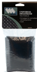
WEM WMSB-AH Sweatband