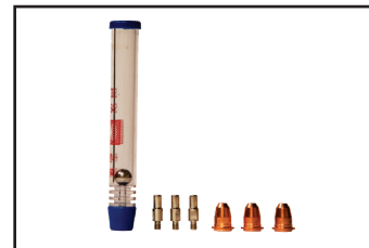
Tips & Accessories