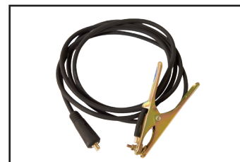
Ground Cable With Clamp