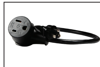
120V Power Adapter