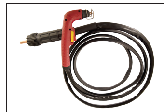
Plasma Torch & Cable