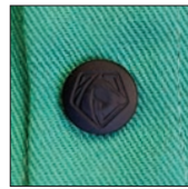
6 convenient front snaps