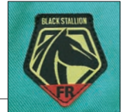
Easy ID FR label