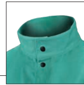
Standup welder's collar